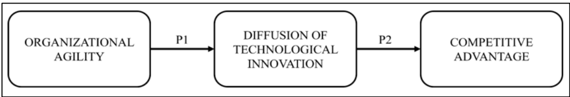
Figure 1: Theoretical Proposition Model

According to the literature, AO, the technological approach has the role of adherence to market changes in the current panorama by developing agility in the organization permeated in the flexibility and in the strategy adopted in its operations performed. The vision adapted to the new context of clean technologies compacts the vision reiterated in primary studies on the importance of the organization creating a strategy in the production and execution of services to promote technological diffusion (Polyakov & Kovshun, 2021; Ravichandran, 2018; Rogers, 1995; Wang et al., 2019).